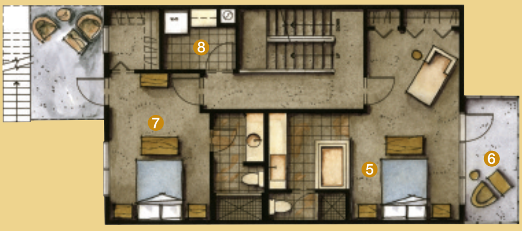
This plan is for marketing purposes only, and is subject to change. All images are artist's renditions only.