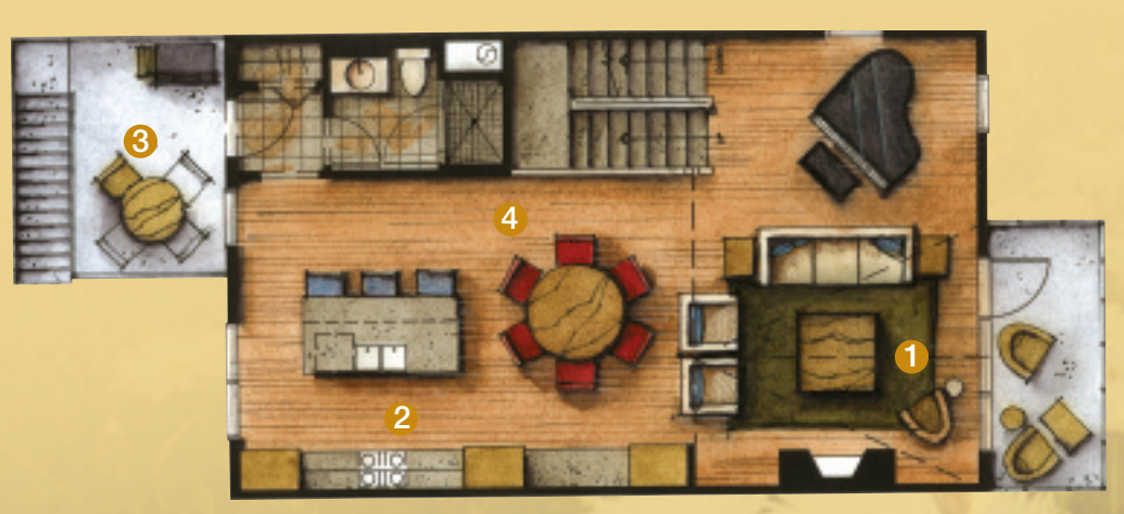
This plan is for marketing purposes only, and is subject to change. All images are artist's renditions only.